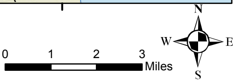
Petaluma Valley GSA Geologic Map

Adapted from CGS 2010 Geologic and Fault Activity Maps of California and Preliminary Geologic Map of the Napa and Bodega Bay 30'x60' Quadrangles, California NAD83, California zone 2, feet